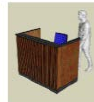
SECURITY POD 3D VIEWS