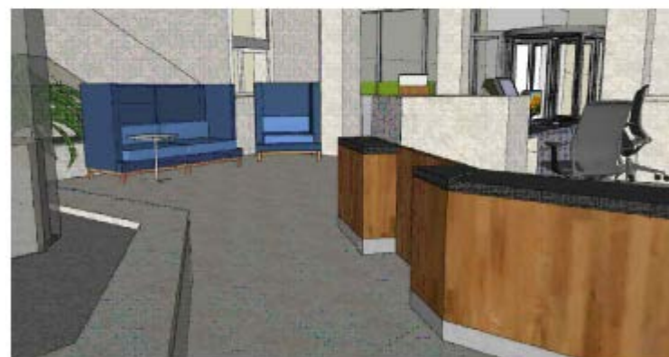
PROPOSED RECEPTION COUNTER 3D IMAGE